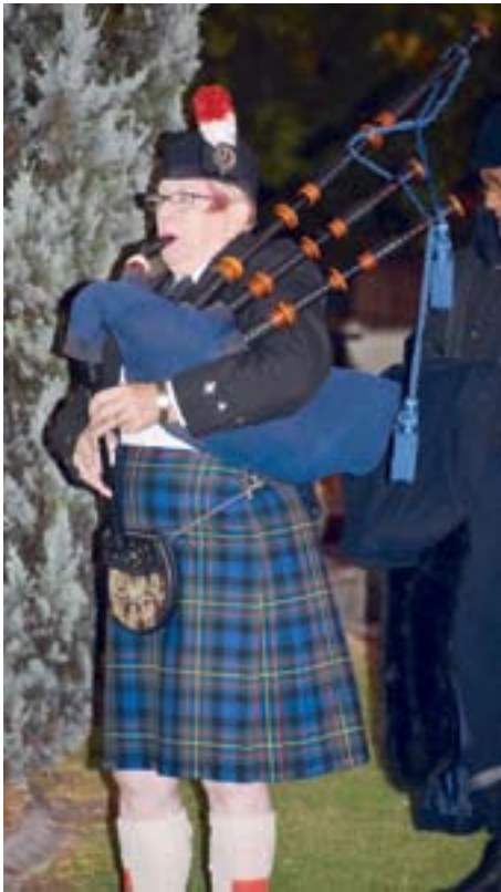
In the early morning gloom comes the swirl of the pipes.