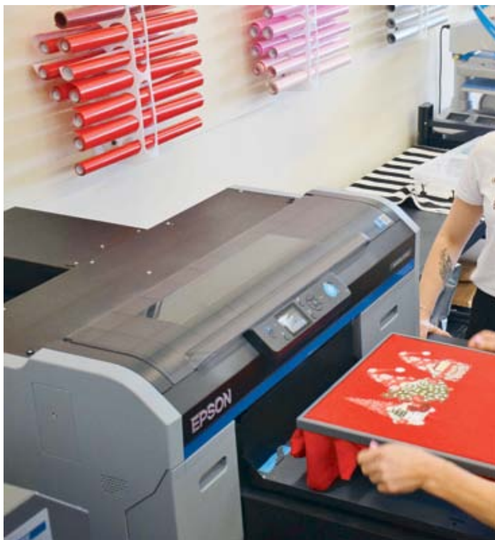
Christmas is coming.