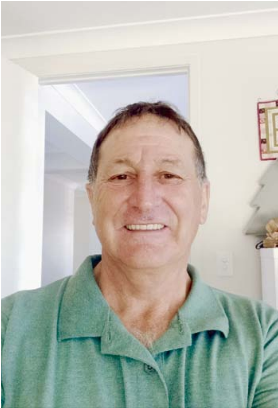
Enjoying his retirement.

I ended up serving twenty or thirty an hour.” Part and parcel of running a fruit shop was the early morning runs to Brisbane for the fruit markets. “You’d have to get up early to go to Brisbane and get a load, but I was pretty blessed really because I use to do it all myself, load my own trucks,” he said. “Towards the end I was getting