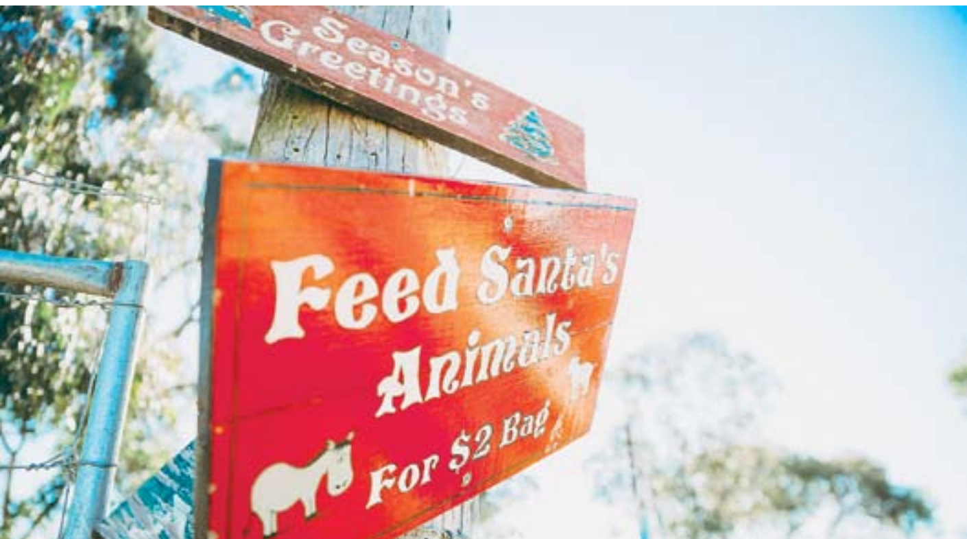
Ready for visiting time.

“We’re just ramping up, we’ve got the baby