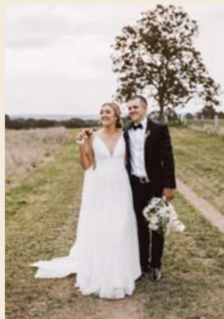
Enjoying the country wedding of their dreams.