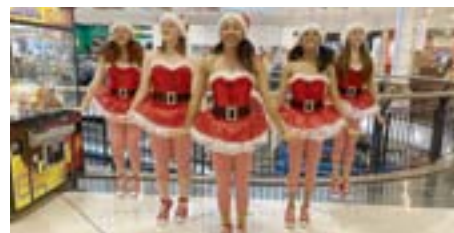
Plenty of entertainment at Rose City this Christmas season.