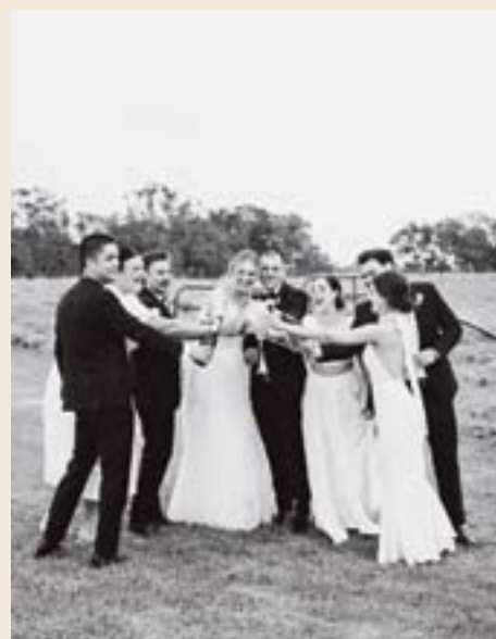
Celebrating in style with the bridal party.