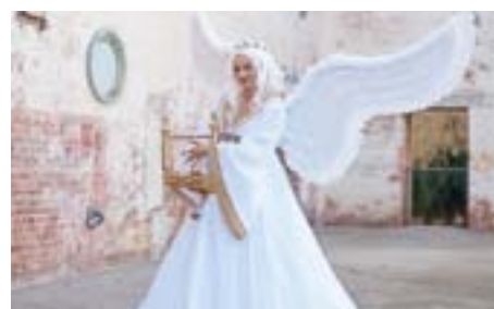
The floating angel.