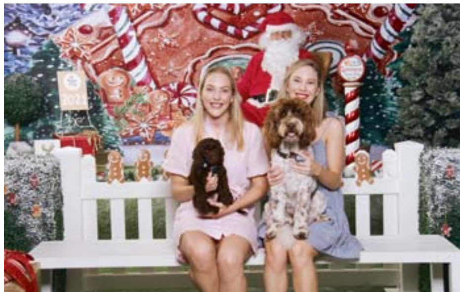
Christmas pictures with pets.

Children can enjoy some downtime and get crafty, make a gift box, tree decorations or design a gift bag.